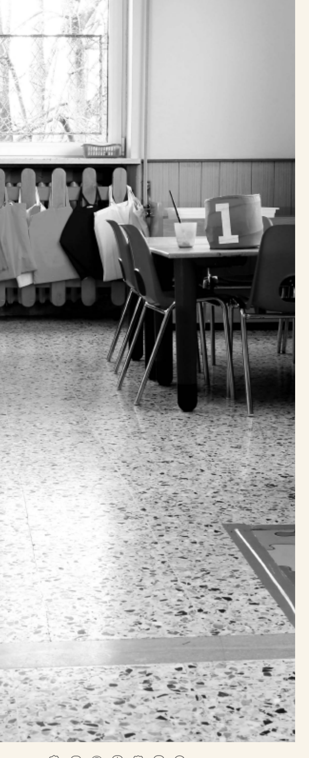
Ontario Chamber of Commerce

As a result of child care and homeschooling, employment among women with toddlers or school-aged children fell 7 percent from February to May, compared to 4 percent among men with children of the same age across Canada.xviii Since then, unemployment has remained especially high for women with children between the ages of 6 and 17.xix