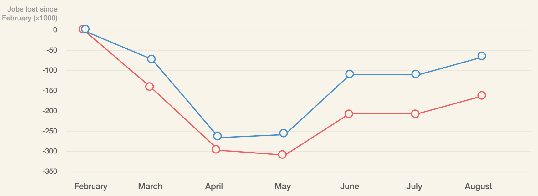
Figure 1: Change in Employment since February 2020 (Ontario)

A primary reason for this job loss disparity is that the occupations and sectors in which women are more likely to be employed were among those most impacted by emergency orders (including retail, food and accommodations, arts and recreation, social services, and other service industries that involve face-to-face contact). Vii This differs notably from