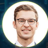
Hon. Sam Oosterhoff Associate Minister of Energy-Intensive Industries Government of Ontario

Ontario is leading Canada’s emission reduction efforts, and energy intensive industries are crucial in this transition. In this fireside chat, Ontario’s newly appointed Associate Minister of Energy-Intensive Industries, Hon. Sam Oosterhoff will share the economic opportunities in decarbonizing energy-intensive sectors, the government’s efforts and programs to support industrial decarbonization, and how emerging technologies are paving the way towards a net-zero future.